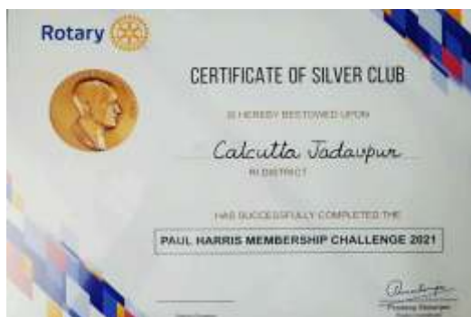
Recognition of RC Calcutta Jadavpur at the District Conference 2021 - "SAMAGAM"

I was overwhelmed by the kindness from the volunteers and people receiving shots. Even if people didn't say thanks, you could see it in their eyes and behind their masks. As I drove back that night, I reflected on how it had been one of my best days since joining Rotary 21 years ago. You could probably see it in my smiling face too.